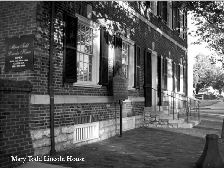
Mary Todd Lincoln House