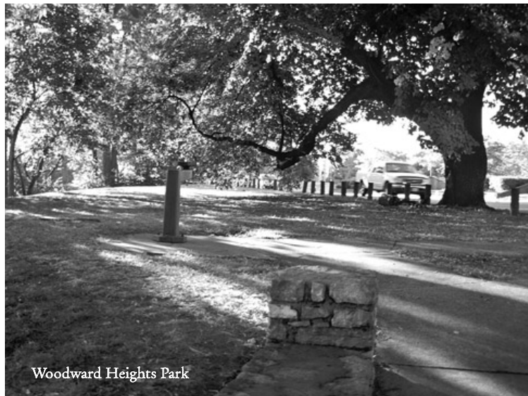
Woodward Heights Park

and natural resources. We hope this will be the beginning of a regional park system that helps preserve our beautiful bluegrass landscape for enjoyment by Central Kentuckians long into the future.