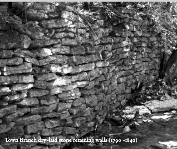
Town Branch dry-laid stone retaining walls (1790 -1840)

Once a scenic waterway, Town Branch has become polluted by industrial and urban runoff. Within a mile of the old Courthouse Town Branch's banks and much of its adjacent land stand quiet and little used as residents, industry, and business have moved away. Historic structures built by the area's founders and the region's early industries stand in need of extensive restoration.